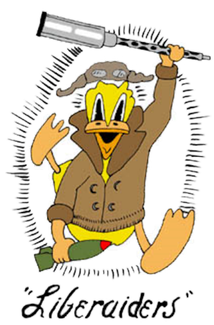
765 Bombardment Squadron (Heavy) emblem

765 Bombardment Squadron, Light emblem: On a disc yellow, bordered black, the head in profile of a saber-toothed tiger in proper colors, on an irregular shaped pattern white, edged red. (Approved, 27 Aug 1954)